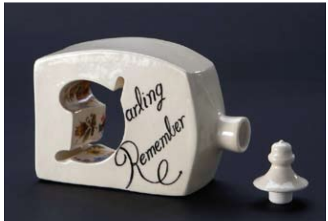
Flask ( Darling Remember ), 5 in. (13 cm) in length, white earthenware, underglaze, glaze, decals, 2010.