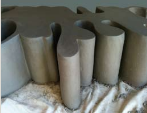
Top: A sculpture of the letter E in progress (shown face down), with leather-hard side-wall slabs shown placed on the front slab. Above: side view of a completed and scraped greenware piece.

After I have created a paper pattern of my design, I flip it over and trace the back of the image with a needle tool onto a prepared and smoothed 1/4-inch-thick wet slab of clay. I flip my pattern so the front of my piece will be flat, lying face down against a ware board. I then cut three-inch strips of clay for the sides of the piece from even wetter slabs of clay, which makes them easier to bend to fit the curves of my pattern. If I am doing a geometric piece, I use leather-hard slabs instead. When the clay slabs have stiffened, I score and slip the side-wall pieces and the face of the piece together. I usually cut the edges of the slabs at a 45° angle so the joint is cleaner, and strengthen the attachments with tiny coils.